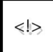
<well known Innovator>