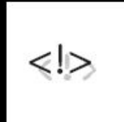
<well known IT profile>